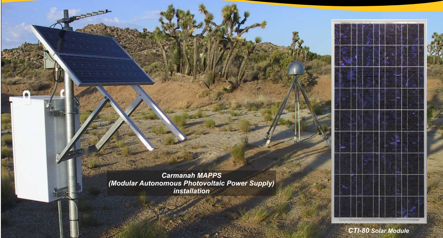
Carmanah MAPPS (Modular Autonomous Photovoltaic Power Supply) installation